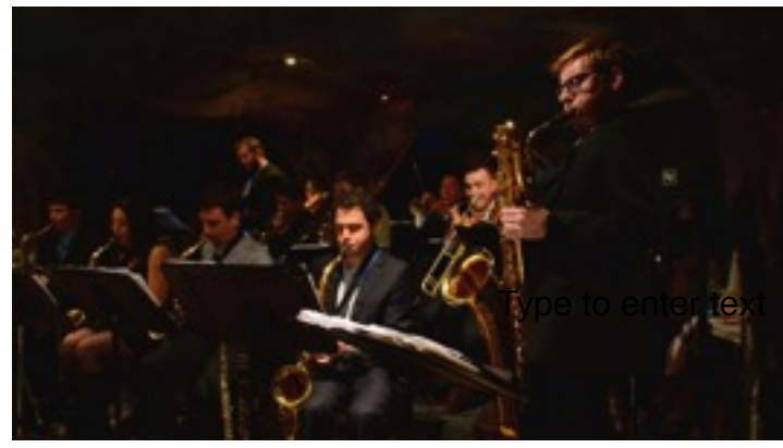
The Bohemian Caverns Big Band.