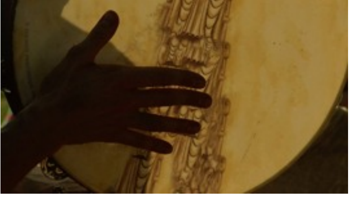
Drummer in Malcolm X Park, Washington, D.C.