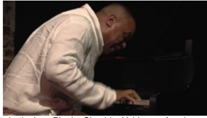
Latin Jazz Pianist Chuchito Valdes performing.