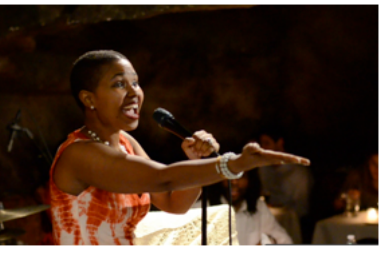
Singer Akua Allrich performing.