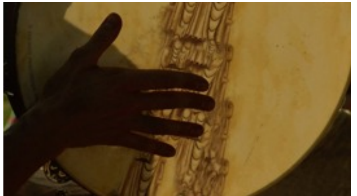
Drummer in Malcolm X Park, Washington, D.C.